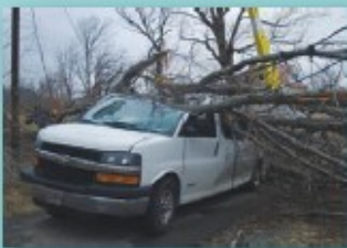
A cottage van destroyed during wind storm.

We thank God for His protection through the extreme weather we have experienced the past several months. Winds in excess of 75 mph have been recorded at our campus. A large tree was uprooted, falling on top of one of our 15-passenger vans. This happened just a few weeks after earlier winds ripped a large portion of roofing from The Jack's Creek Lodge at The Oaks Retreat Center. Those damages were estimated at $15,000. Thankfully, no one was hurt in either incident. If you would like to make a donation to help recover a portion of our insurance deductible, please earmark your gift, "Wind Damage."