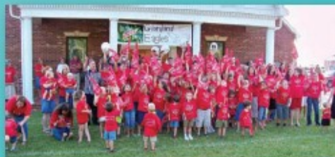
CalvaryFWB Church, Glendale Springs, NC, participants in our 2010 VBS Campaign.

Thank you to all the churches who participated in our "Children Helping Children" VBS Campaign last year, and we hope you will adopt Family Ministries as your VBS project this summer, also. For more information, contact 423.278.1564.