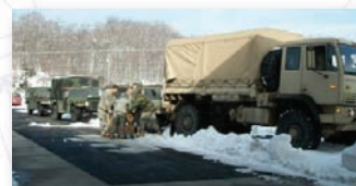
The Guard to the Rescue!

On December 18, a huge snow storm hit southwest Virginia and east Tennessee. Thousands lost power and water, including The Laurels Retirement and Assisted Living , where the staff and residents had to rely on backup systems. The National Guard, Sheriff's Department and other community organizations came together to make sure everyone was safe, warm and well-taken care of.