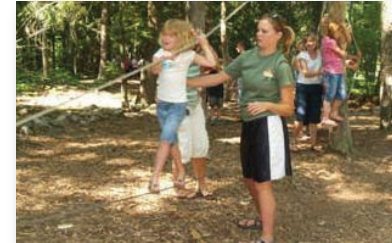
Ropes course teamwork

Our camp season will soon be in full swing, with available camps in which to participate – a great place to get closer to nature, friends and especially God. Call today for more information at 423-470-2226.