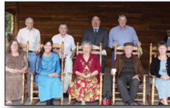
Pictured are some very special guests who joined us during our Homecoming Celebration.

This extraordinary day would not have been possible without the participation of many. We would like to express our heartfelt gratitude to our guest speaker, singers, volunteers, young people and staff. What a joyous time of celebration as we commemorated our 70th anniversary in service to children and families.